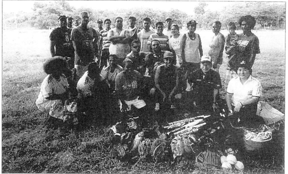
Players with donated equipments.