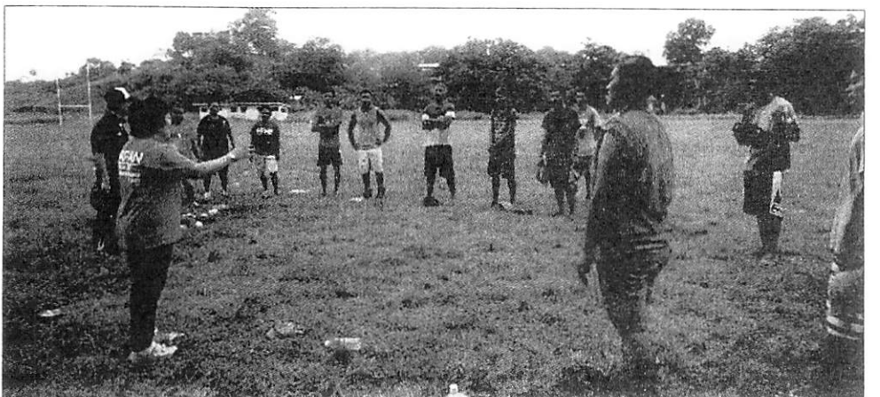
Briefing after the fielding clinic