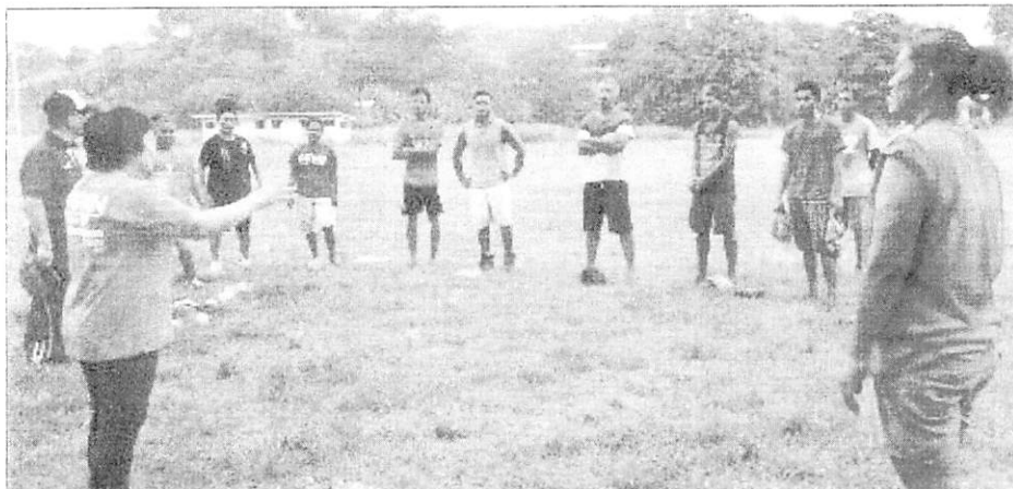
Softball clinic early this week.

Meanwhile softball players got big X-mas gift from Pan Oceanic Bank (POB) and Japanese softball players.